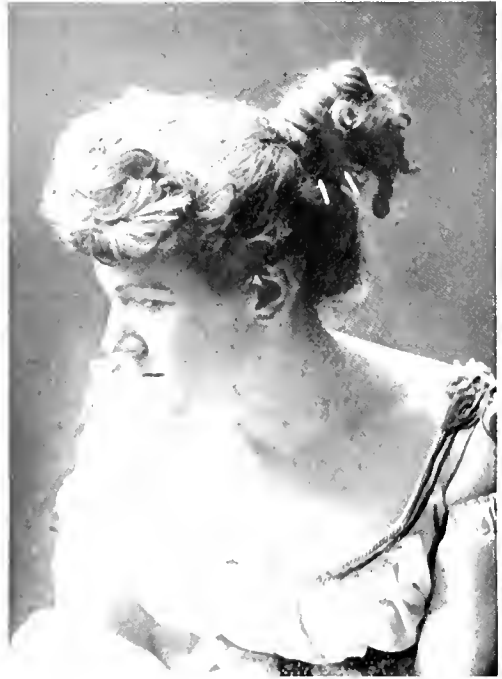
ELLA WHEELER WILCOX.

WILCOX, Mrs. Ella Wheeler , author, was born in Johnstown Center, Wis. Her parents were